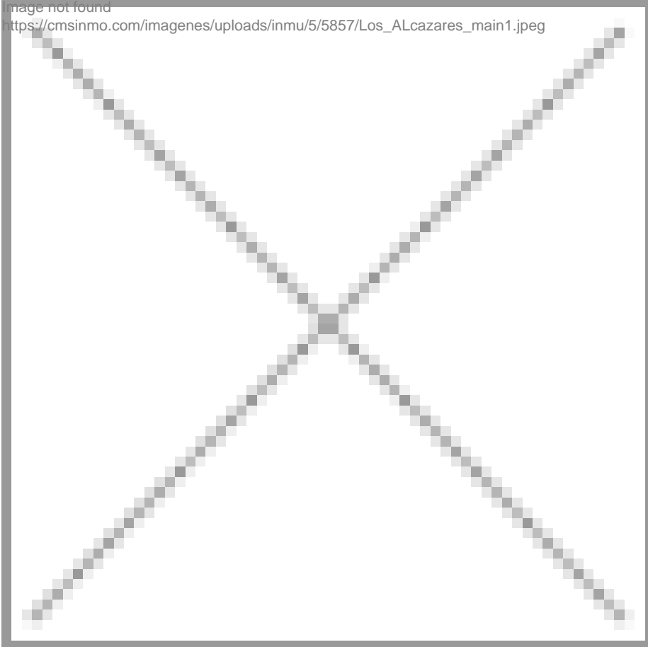
image not found https://cmsinmo.com/imagenes/uploads/inmu/5/5857/Los_ALcazares_main1.jpeg