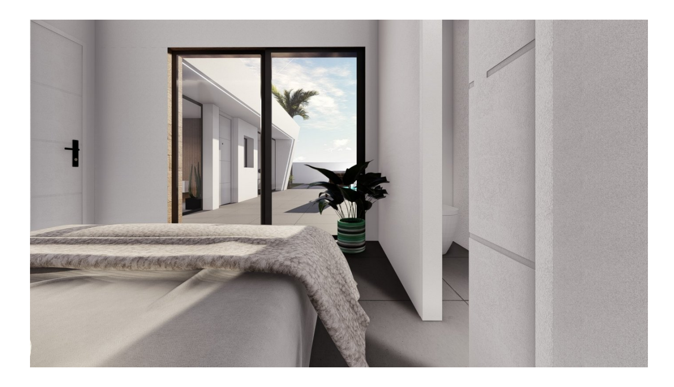
"Experience our experience - Because you deserve the best"