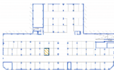
Ubicadas en Planta Garaje/Location in Parking floor