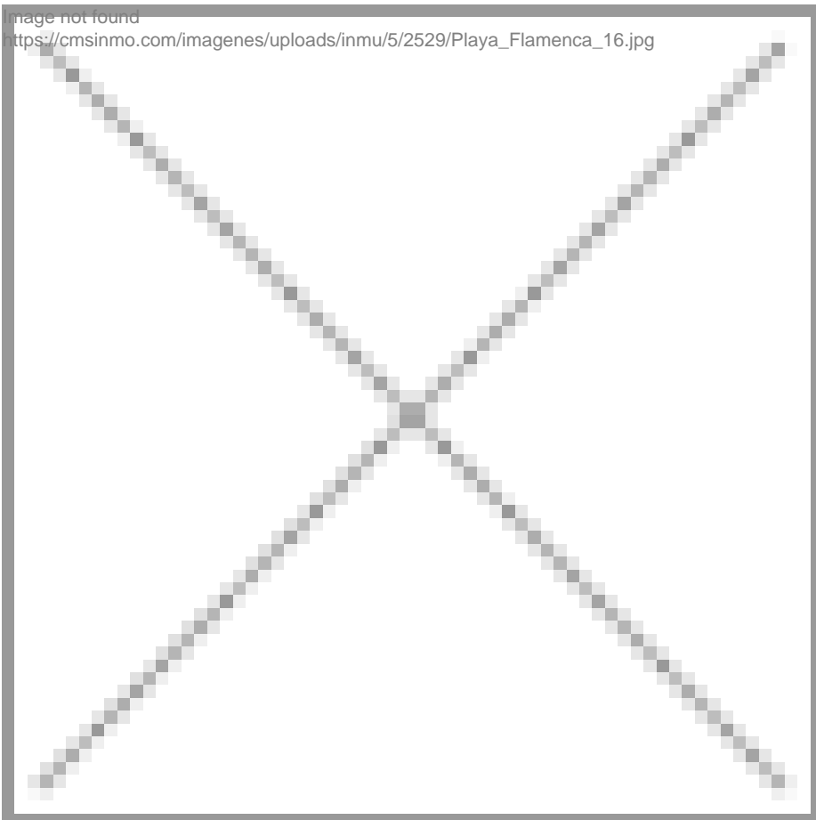
image not found https://cmsinmo.com/imagenes/uploads/inmu/5/2529/Playa_Flamenca_16.jpg