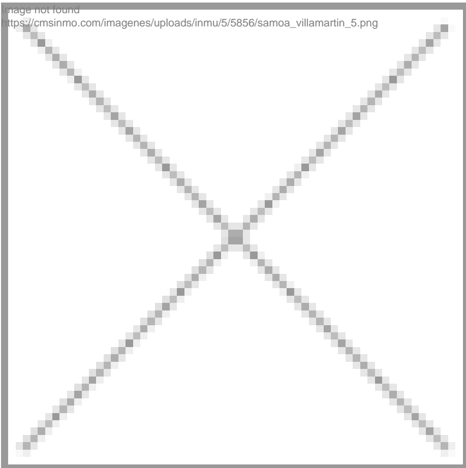
image not found https://cmsinmo.com/imagenes/uploads/inmu/5/5856/samoa_villamartin_5.png