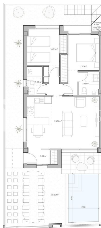
Ground floor / Planta baja