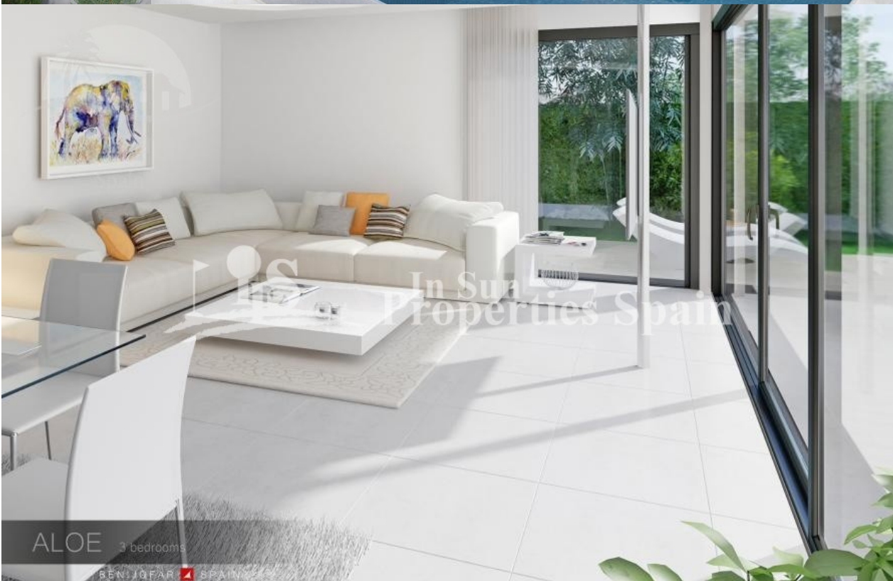
ALOE 3 bedrooms