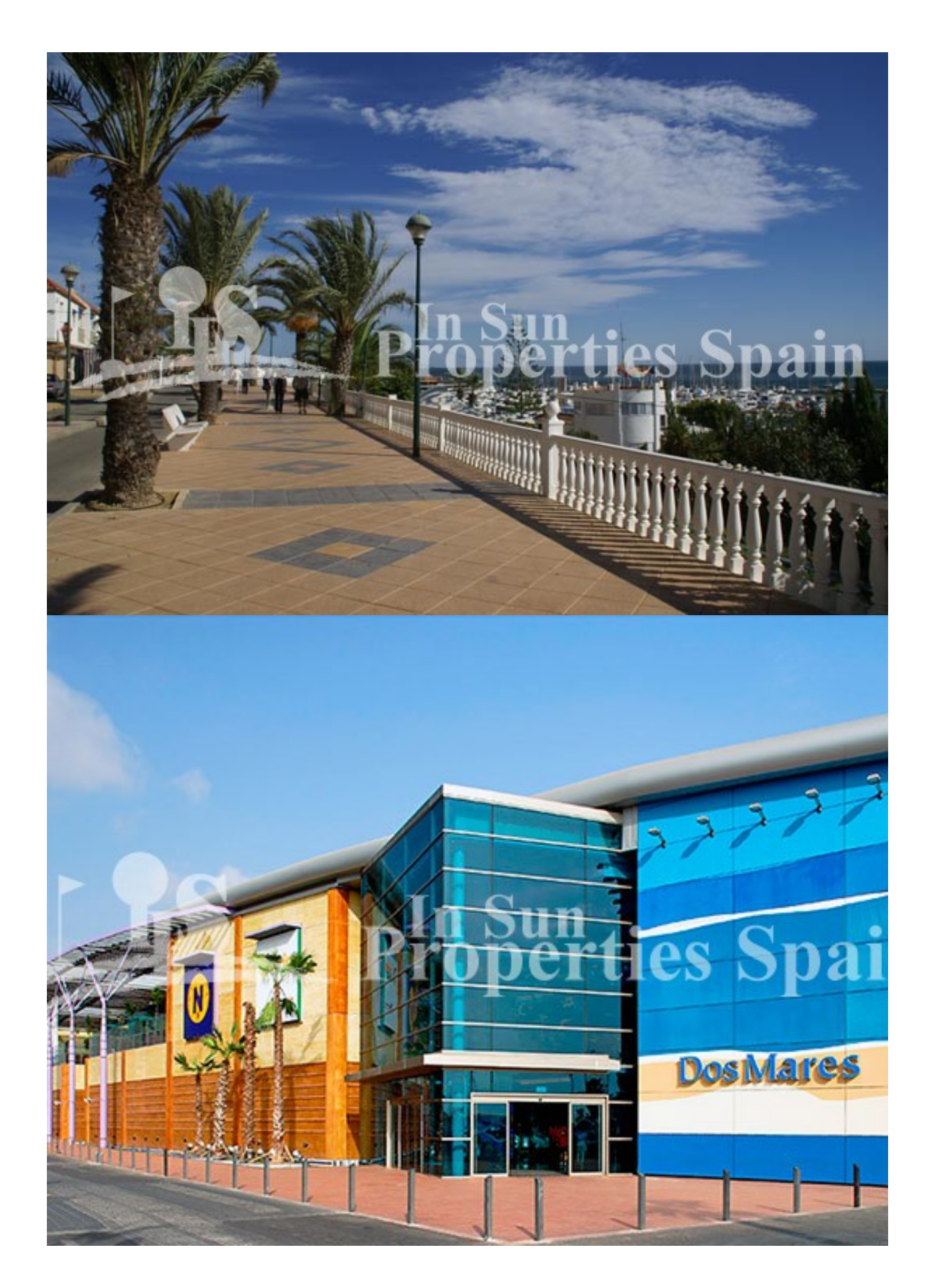
"Experience our experience - Because you deserve the best"