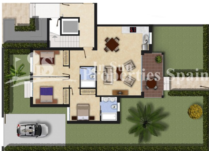
Imagen Artística carece de valor contractual/Artistic Image free of contractual nature