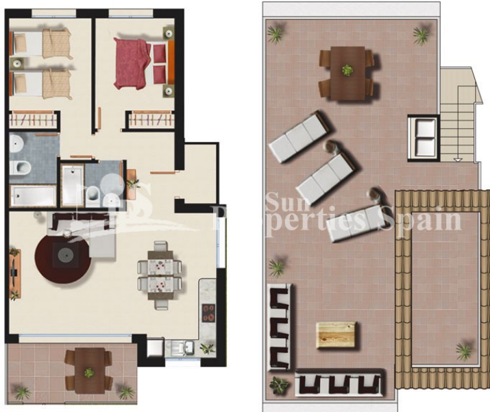
Imagen Artística carece de valor contractual/Artistic Image free of contractual nature