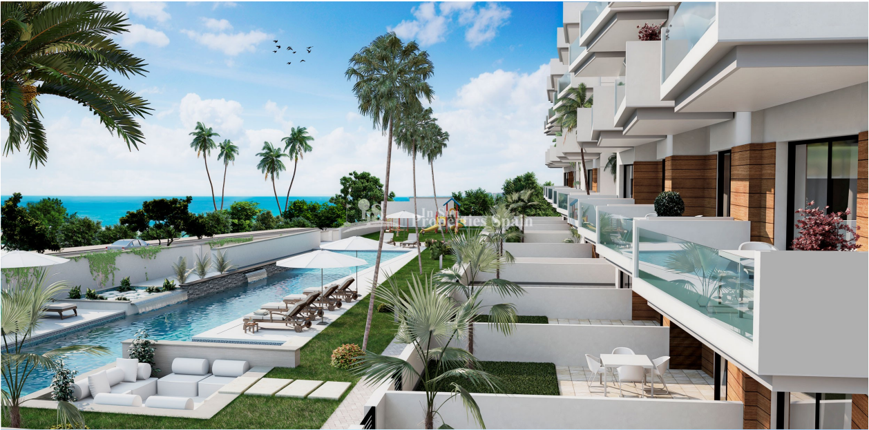
Aereal View Mare Nostrum - Guardamar