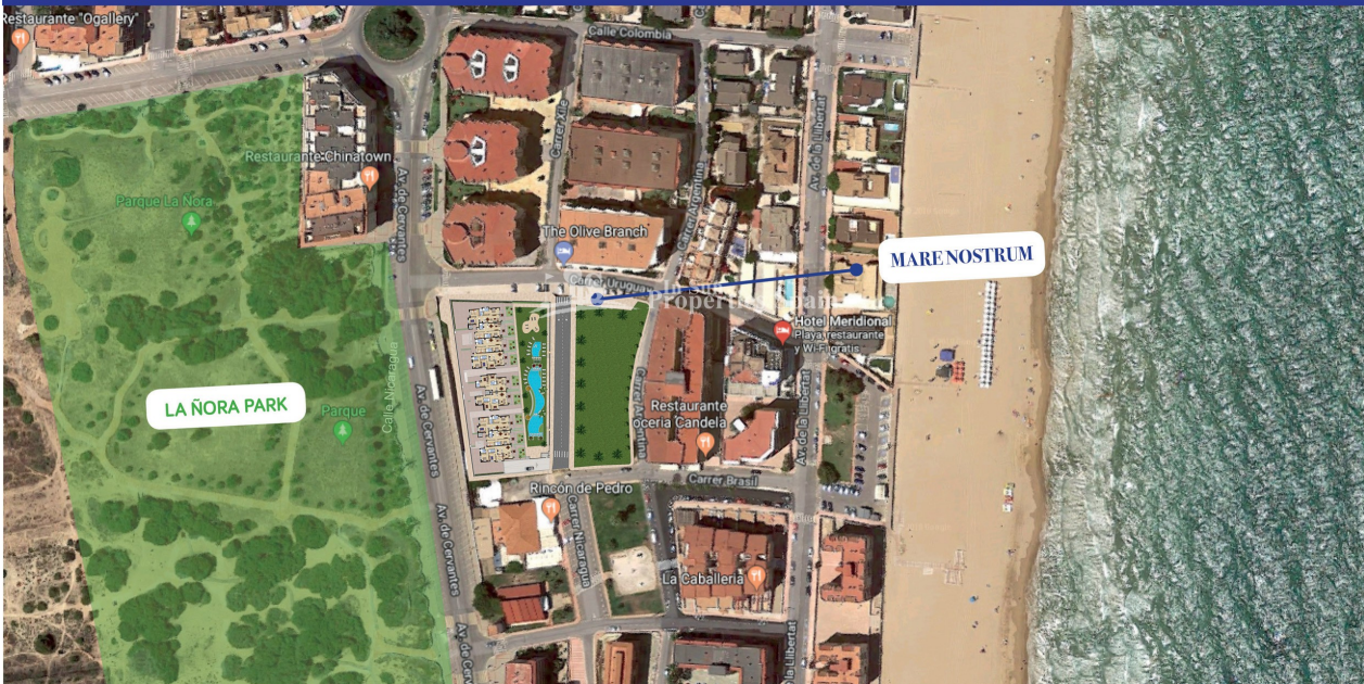
Aereal View Mare Nostrum - Guardamar

Artistic Image Free Of Contractual Nature