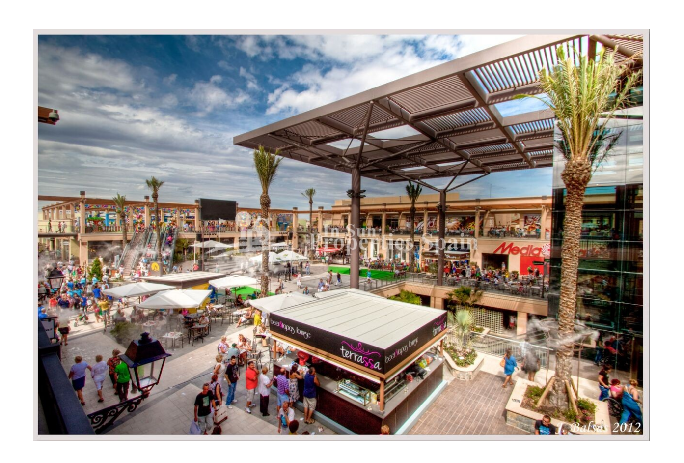
"Experience our experience - Because you deserve the best"