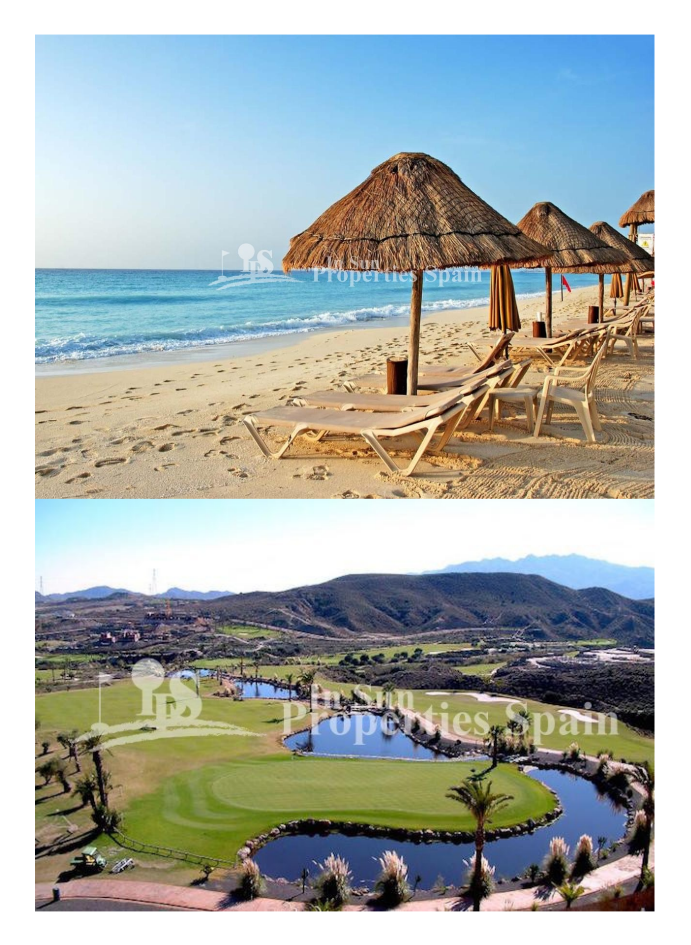
"Experience our experience - Because you deserve the best"