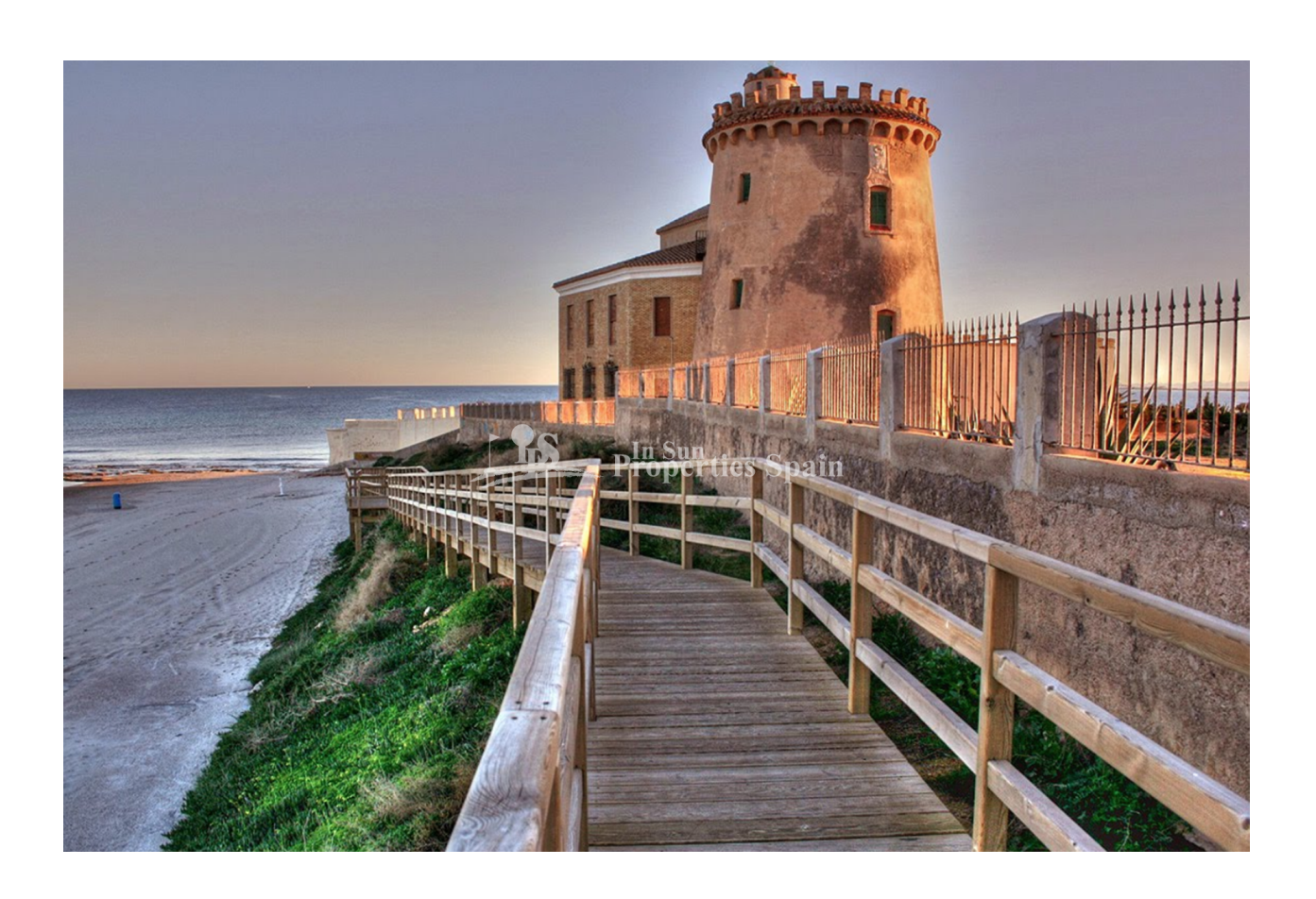
"Experience our experience - Because you deserve the best"