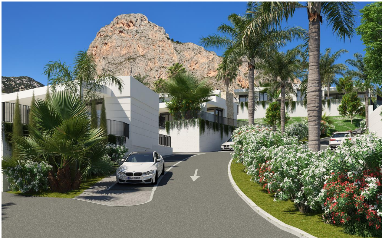
-Viviendas Unifamiliares en Polop de La Marina- 185 viviendas, piscinas, zonas comunes y club social