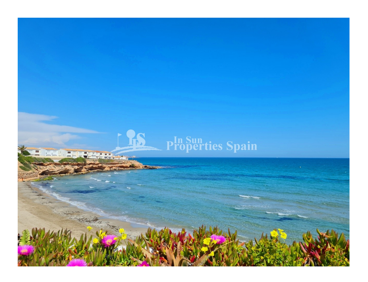
"Experience our experience - Because you deserve the best"