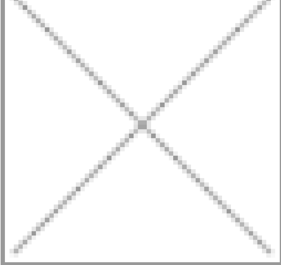
image not found https://cmsinmo.com/imagenes/uploads/inmu/4/3215/charco_property_the_old_house_3531[1].jpg