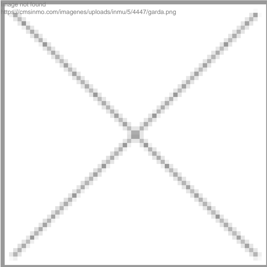
image not found https://cmsinmo.com/imagenes/uploads/inmu/5/4447/garda.png