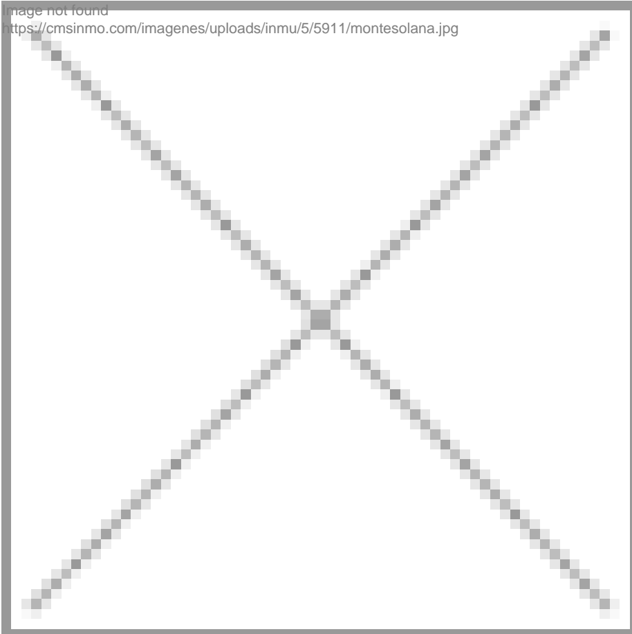
image not found https://cmsinmo.com/imagenes/uploads/inmu/5/5911/montesolana.jpg

ORIHUELA COSTA (VILLAMARTIN LOS DOLSES )