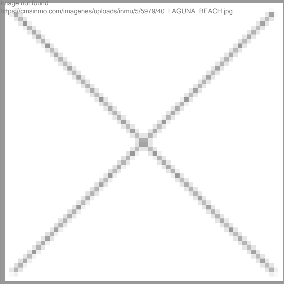
image not found https://cmsinmo.com/imagenes/uploads/inmu/5/5979/40_LAGUNA_BEACH.jpg