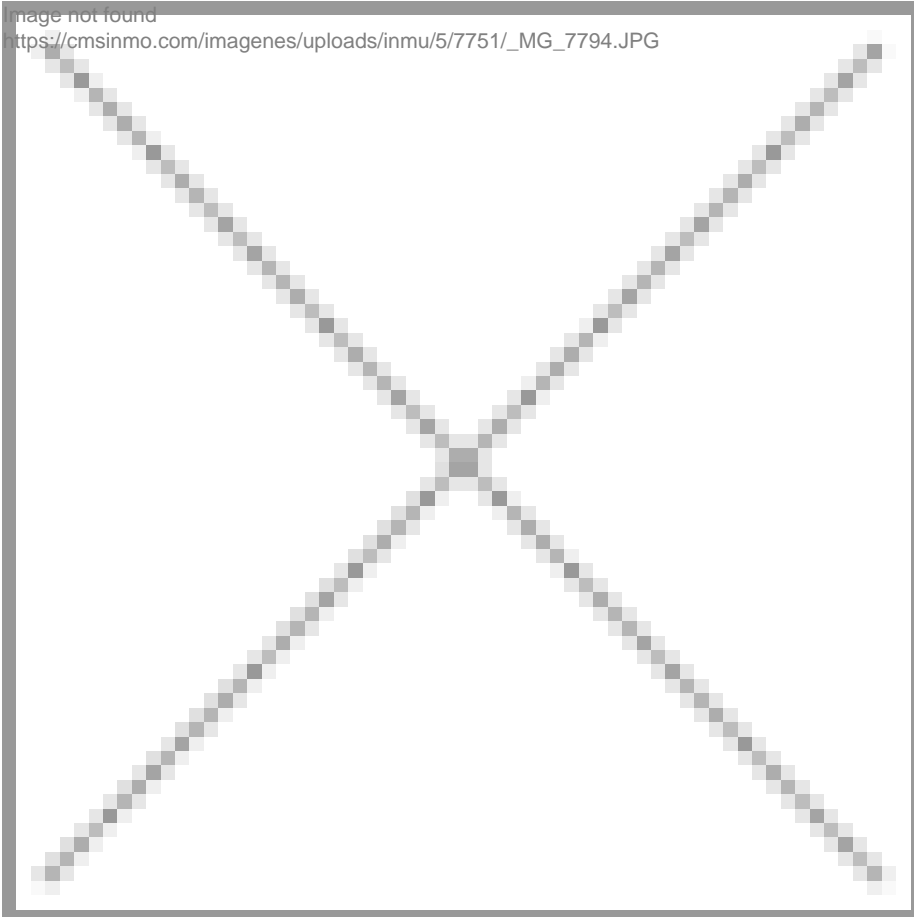
image not found https://cmsinmo.com/imagenes/uploads/inmu/5/7751/_MG_7794.JPG