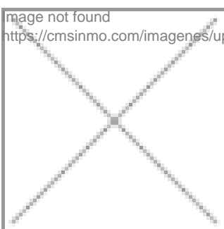
image not found https://cmsinmo.com/imagenes/uploads/inmu/5/7813/5.jpg

image not found https://cmsinmo.com/imagenes/uploads/inmu/5/7813/4.jpg