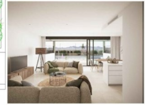
3 BEDROOMS / 3 DORMITORIOS