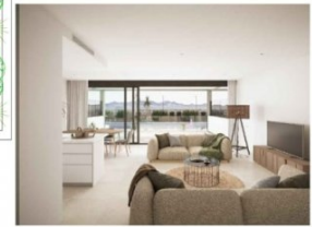
3 BEDROOMS / 3 DORMITORIOS