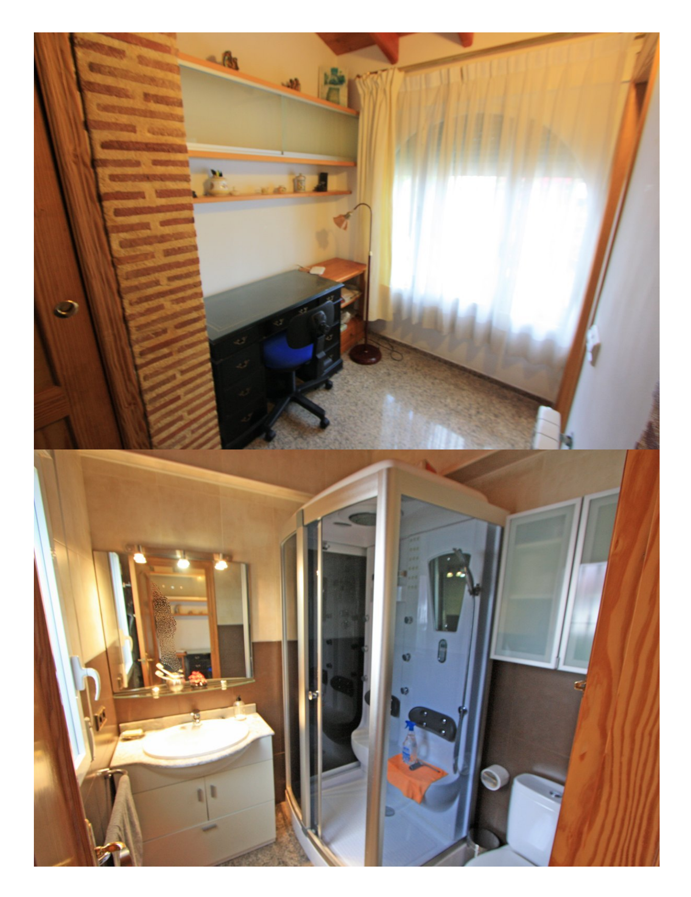
"Experience our experience - Because you deserve the best"