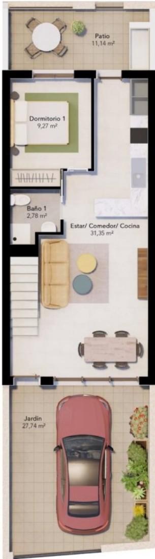
PLANTA BAJA GROUND FLOOR