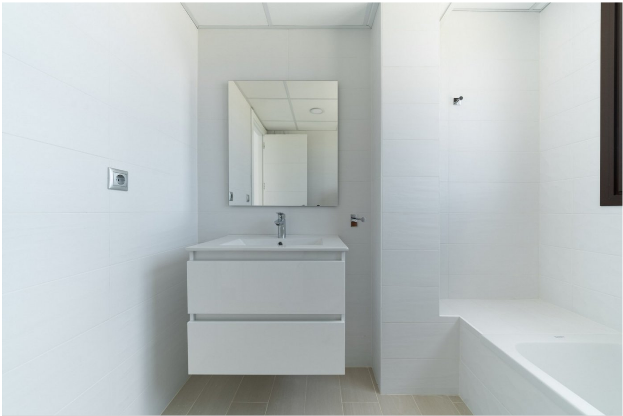
PLANTA BAJA - GROUND FLOOR