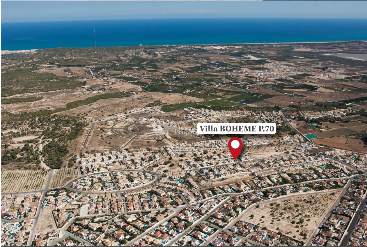
La Fiesta I-II Aerial View