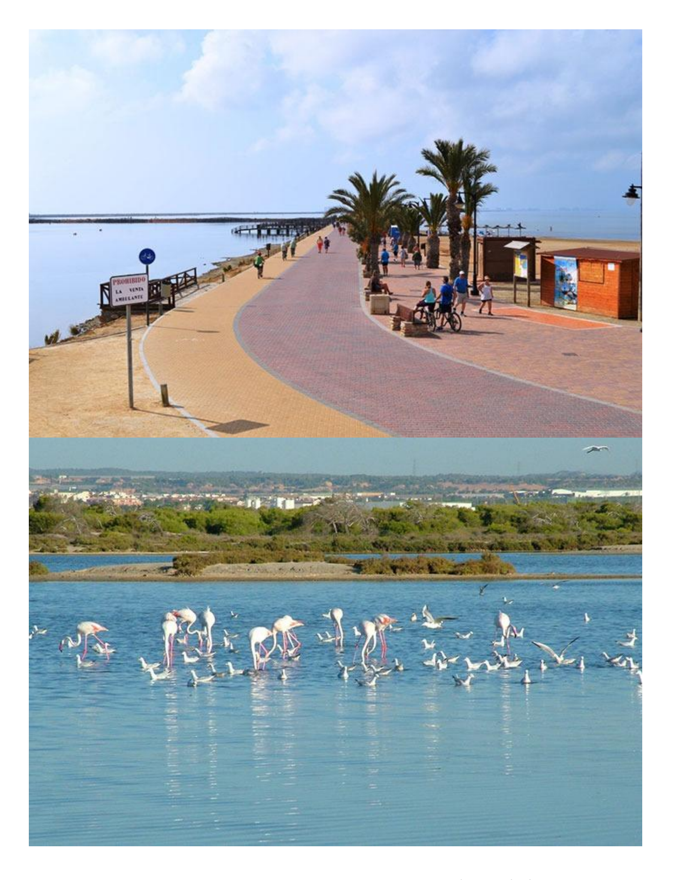
"Experience our experience - Because you deserve the best"