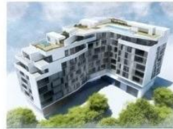
Superficies: Vivienda 3d