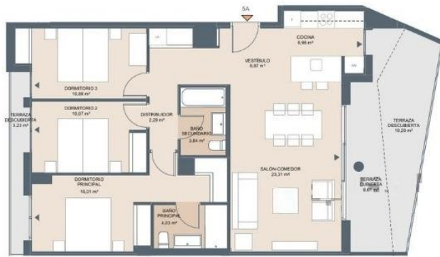
Esc. 2 P05-A