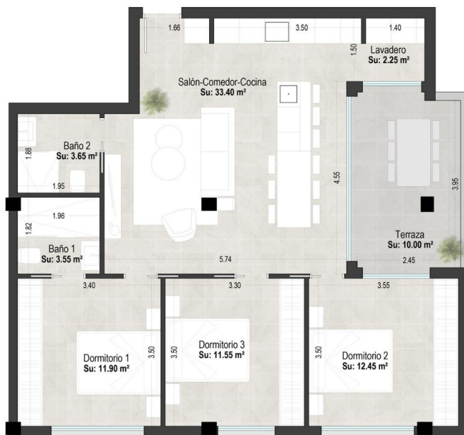
tabla de superficies