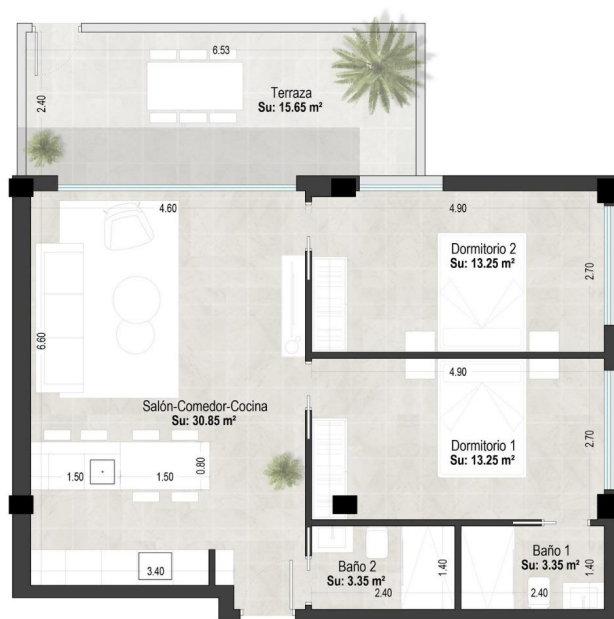
tabla de superficies