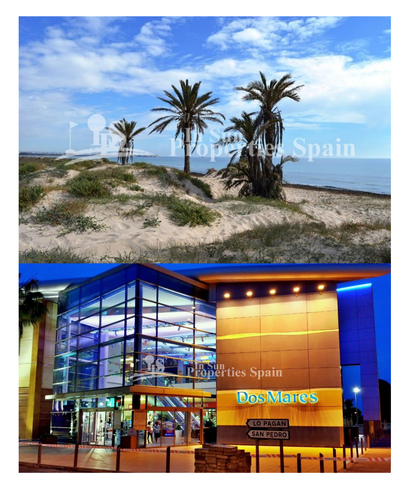
"Experience our experience - Because you deserve the best"