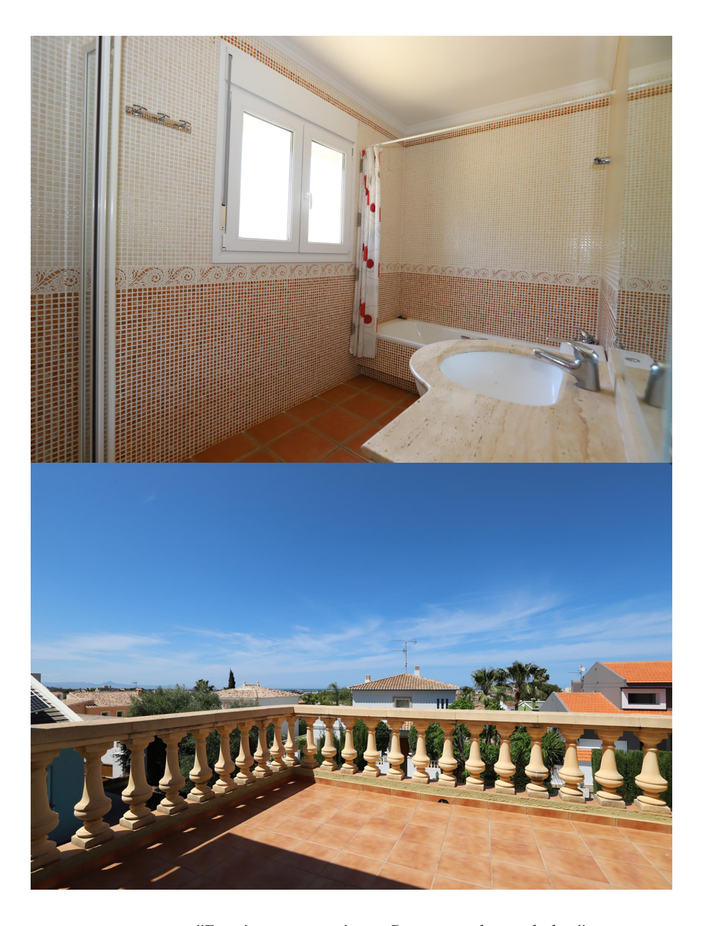
"Experience our experience - Because you deserve the best"