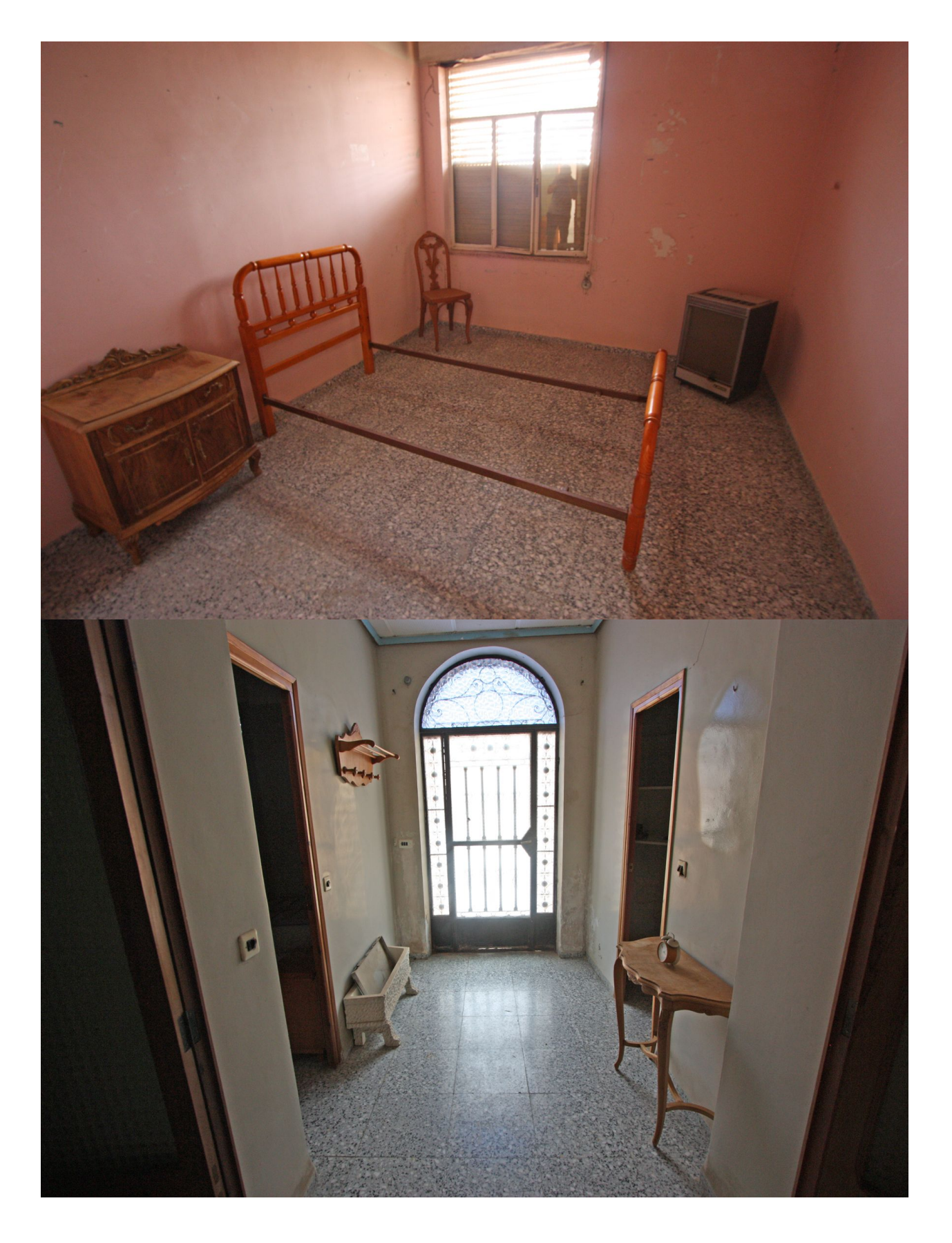
"Experience our experience - Because you deserve the best"