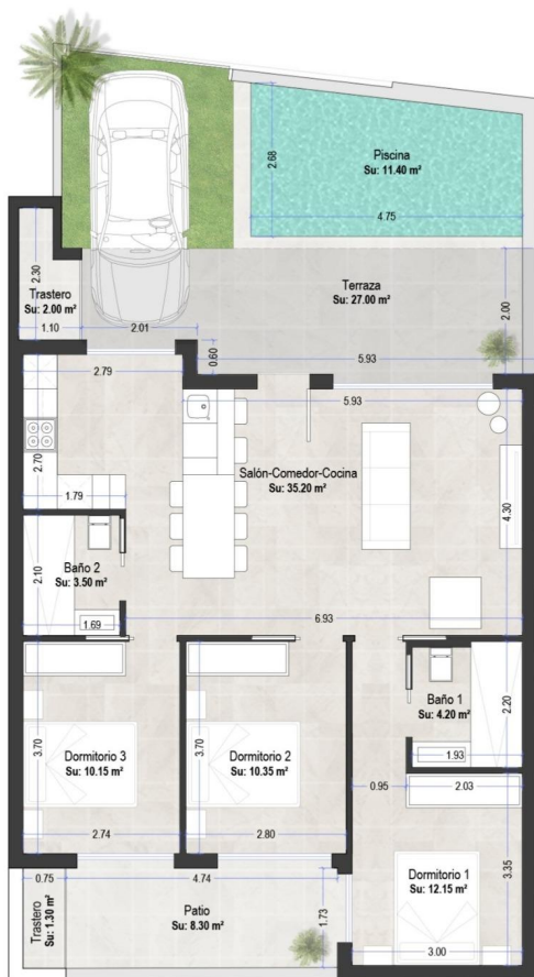
tabla de superficies