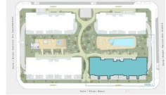
BLOQUE 1 - Solarium