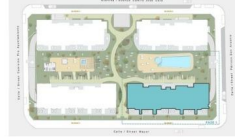
BLOQUE 1 - Solarium