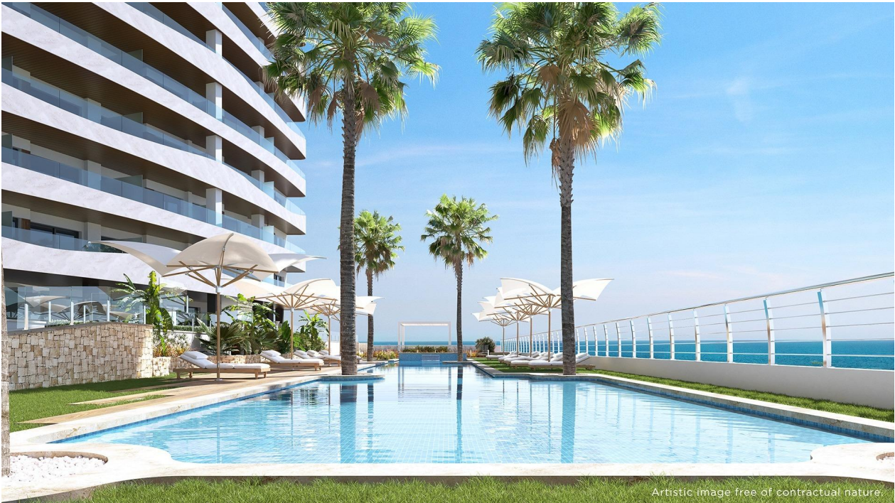
Artistic image free of contractual nature.