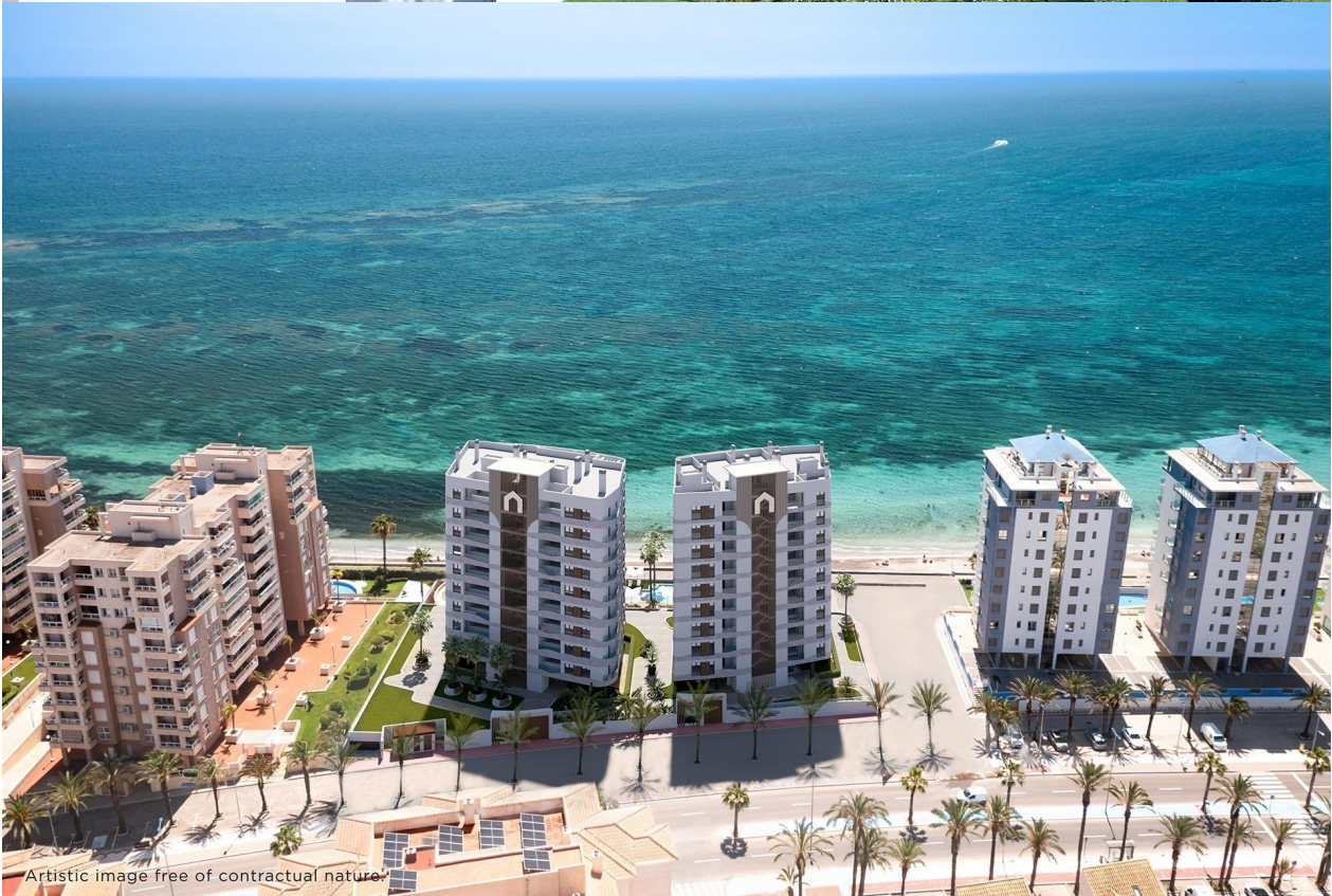
Artistic image free of contractual nature.