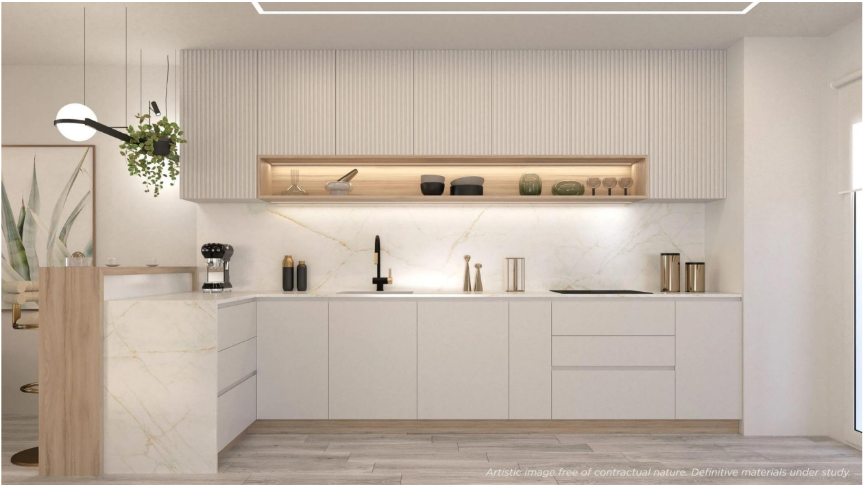
Artistic image free of contractual nature. Definitive materials under study.