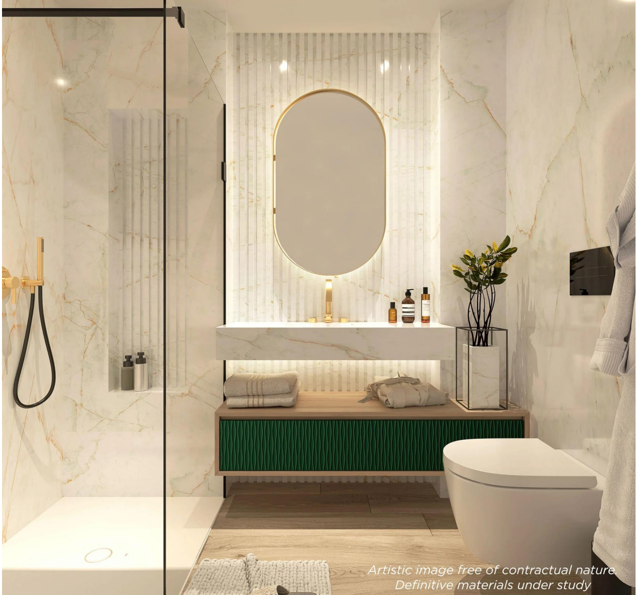
Artistic image free of contractual nature. Definitive materials under study