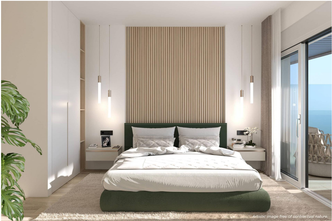
Artistic image free of contractual nature.