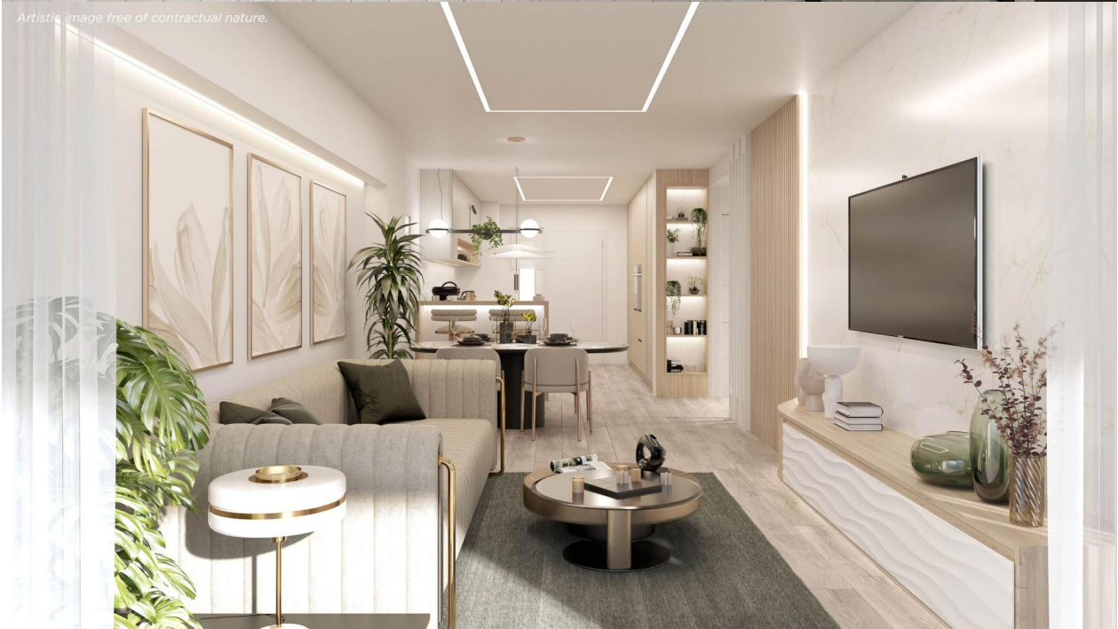
Artistic image free of contractual nature.