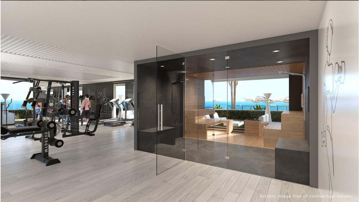
Artistic image free of contractual nature.