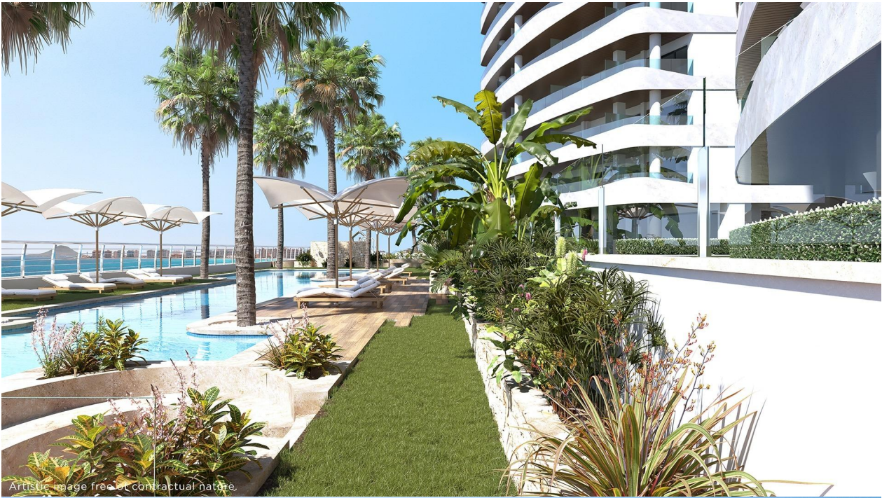
Artistic image free of contractual nature.