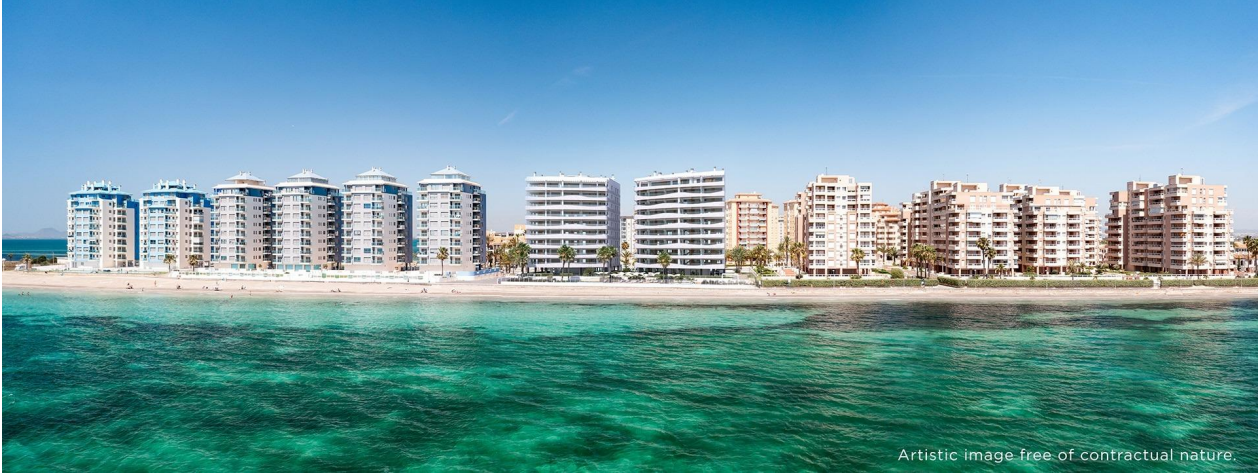
Artistic image free of contractual nature.