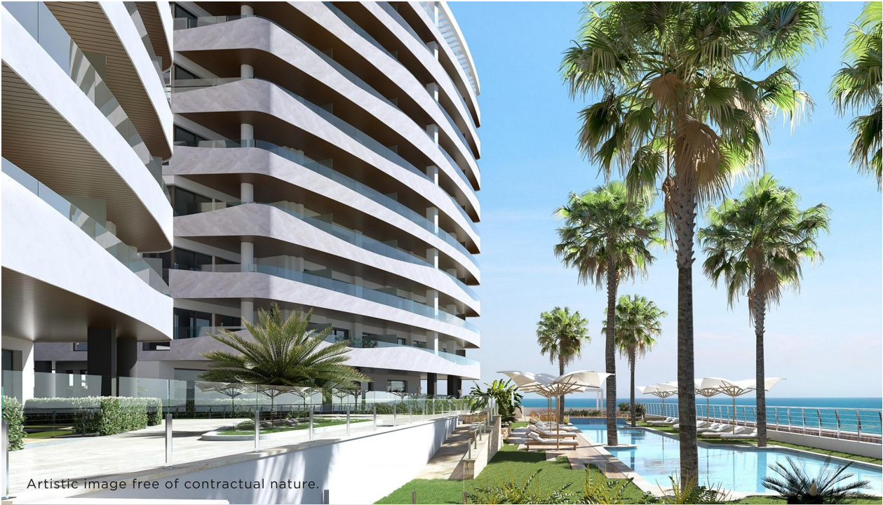
Artistic image free of contractual nature.