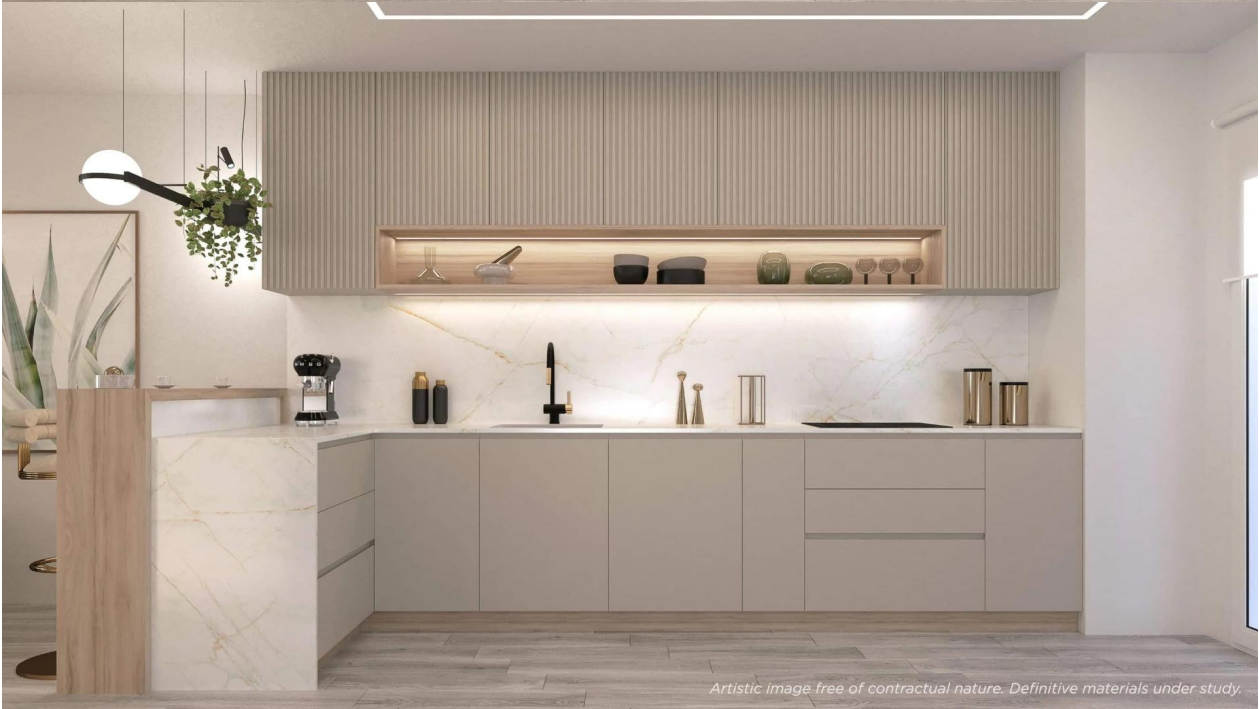
Artistic image free of contractual nature. Definitive materials under study.