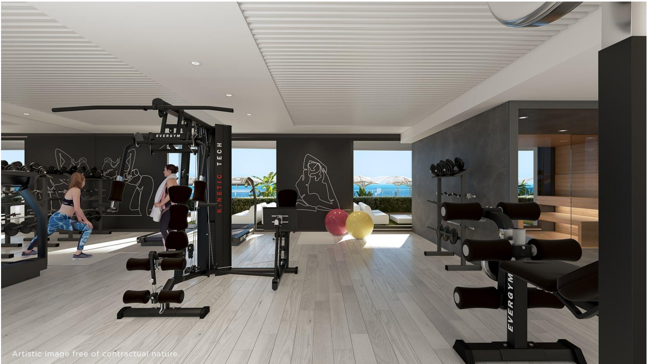
Artistic image free of contractual nature.