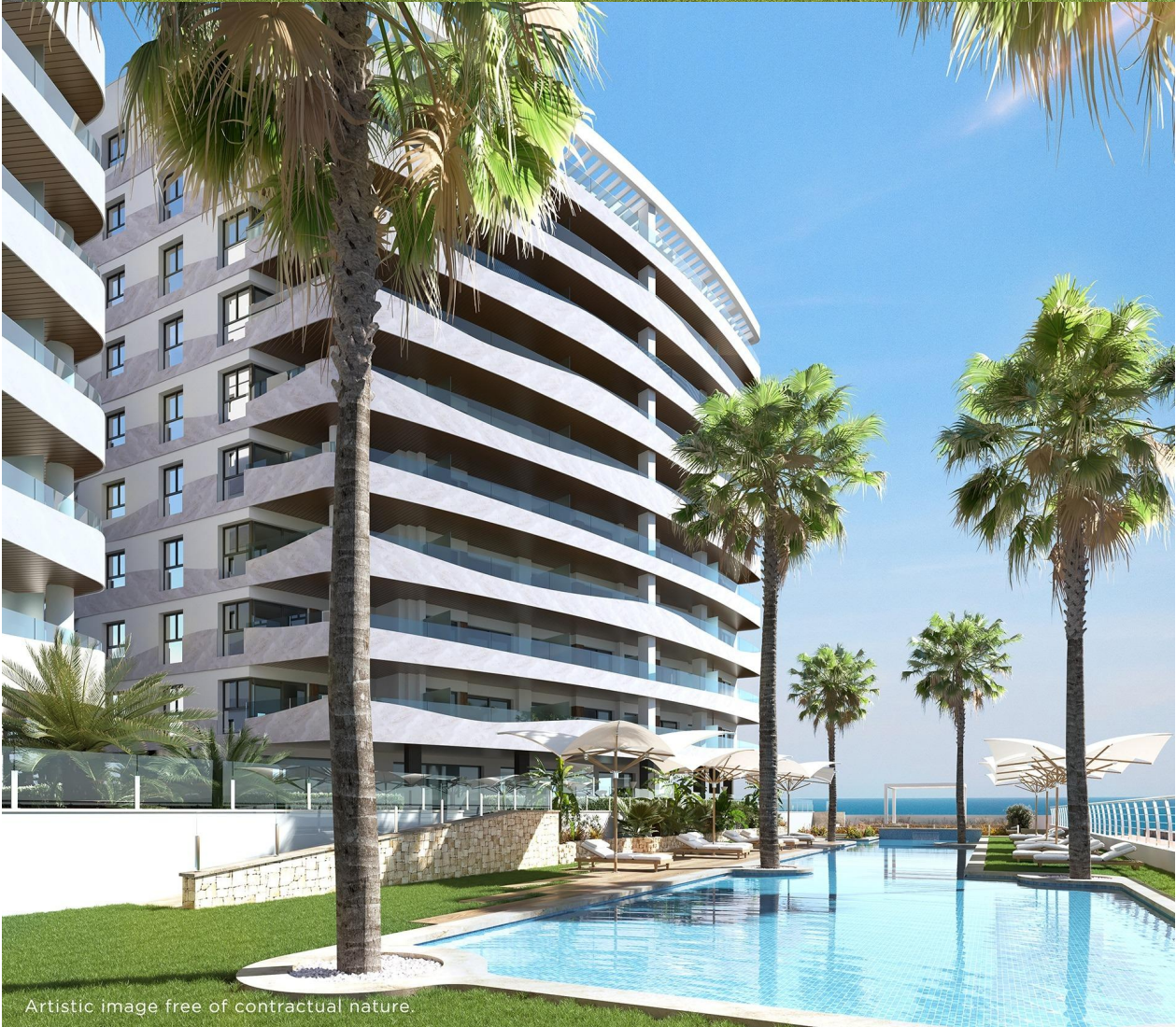
Artistic image free of contractual nature.