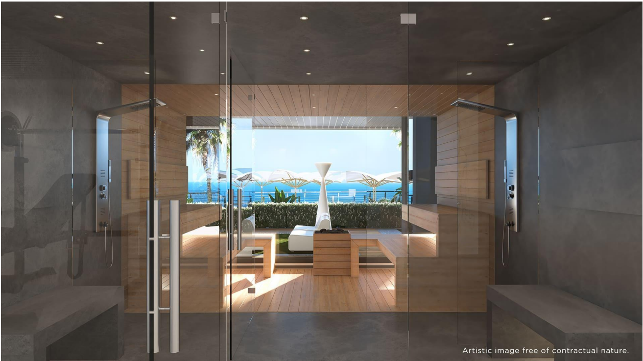
Artistic image free of contractual nature.