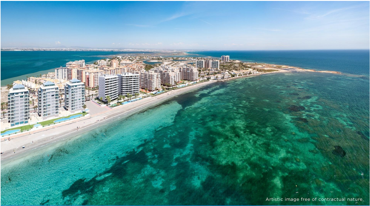
Artistic image free of contractual nature.