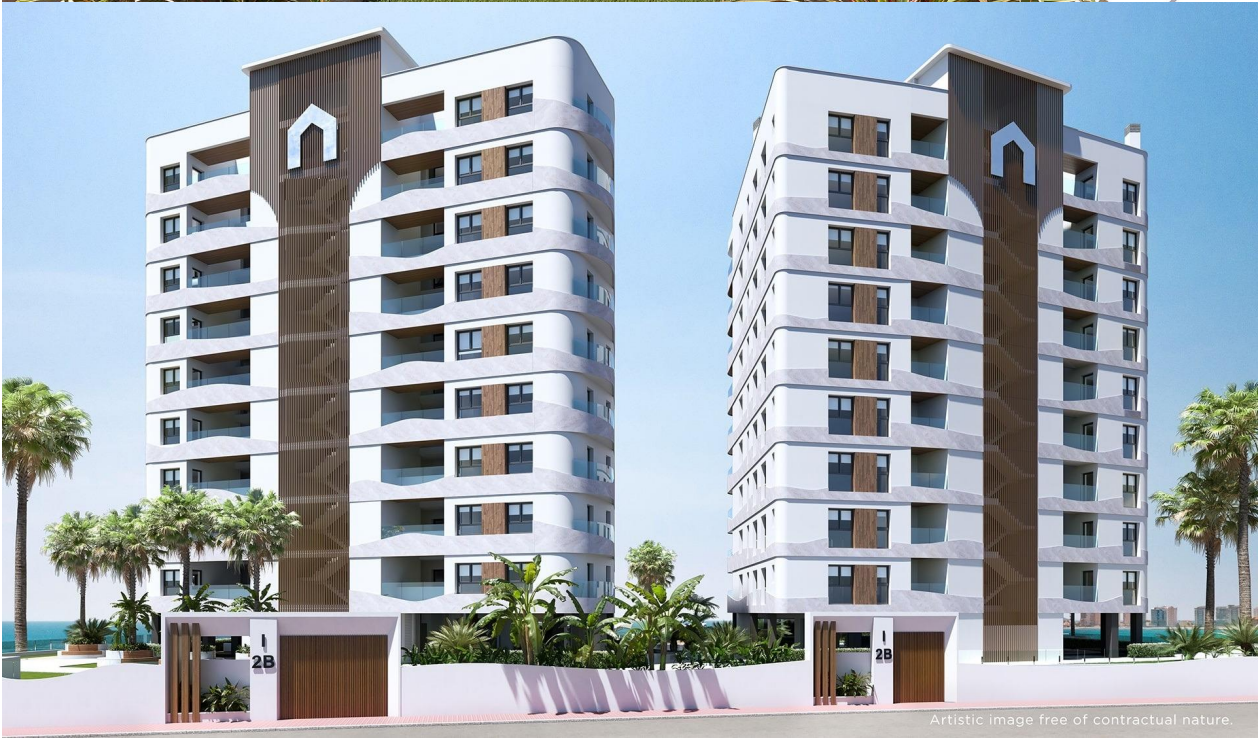
Artistic image free of contractual nature.