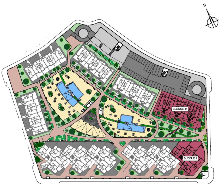
PLANTA DE CONJUNTO (FASE 1)

Este documento (tanto su parte gráfica como los datos referidos a superficies) tienen carácter meramente orientativo, sin perjuicio de la información más exacta contenida. Los datos referidos a superficies son meramente orientativos y pueden sufrir variaciones como consecuencia de exigencias comerciales, jurídicas, técnicas o de ejecución de proyecto.