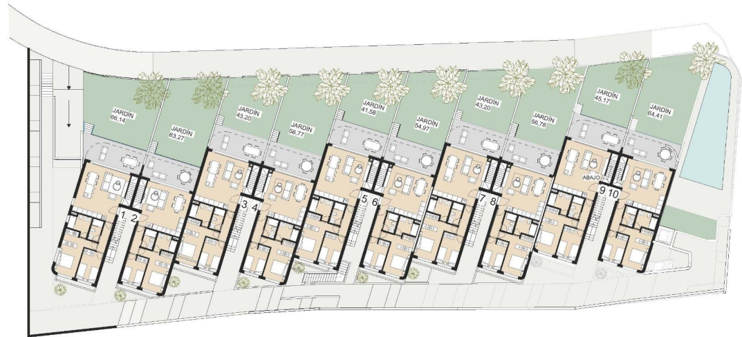
PLANTA BAJA / GROUND FLOOR

Plano sujeto a posibles modificaciones por razones o exigencias de índole técnica y jurídica Floor plan opened to modifications for technical or legal reasons