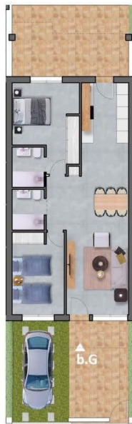
Planta baja / Ground floor