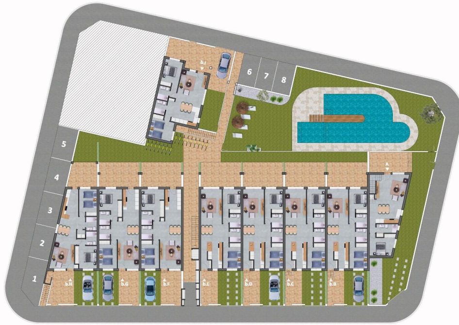
Planta baja / Ground floor

NOTA: Los planos quedan sujetos a posibles modificaciones de carácter técnico, en función del desarrollo del proyecto y de la obra, según indicaciones de la dirección facultativa. El amueblamiento reflejado tiene únicamente efectos decorativos, las dimensiones que se representan en este plano y en su leyenda son aproximadas, las definitivas serán las que resulten de la ejecución de la obra. Se hace entrega de la obra solo con el mobiliario y electrodomésticos que se indican en la memoria de cantidades. El mobiliario de la cocina y la disposición de los sanitarios puede sufrir ligeras variaciones en función del montaje definitivo.