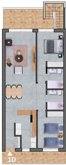
Planta primera / First floor