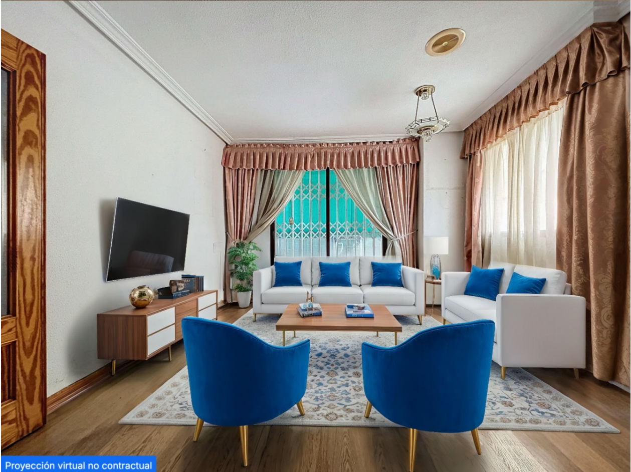
Proyección virtual no contractual