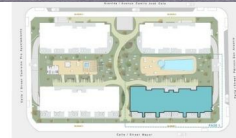
BLOQUE 1 - Planta 1ª