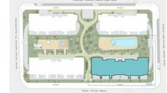
BLOQUE 1 - Planta 1ª