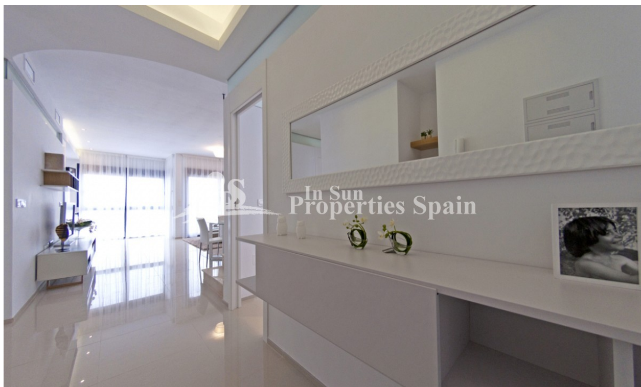
First Floor Apartment with 2 Bedrooms - 2 Bathrooms