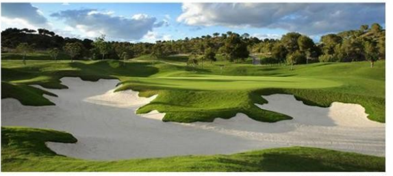
LAS COLINAS GOLF