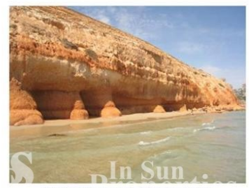
CALA JUNTO A PLAYA DE AGUAMARINA