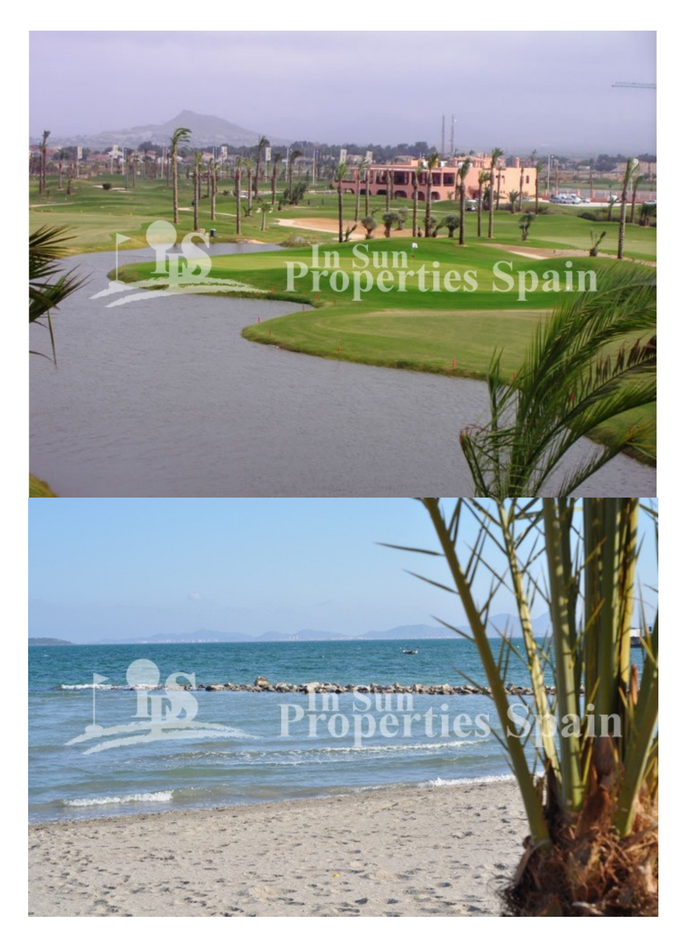
"Experience our experience - Because you deserve the best"