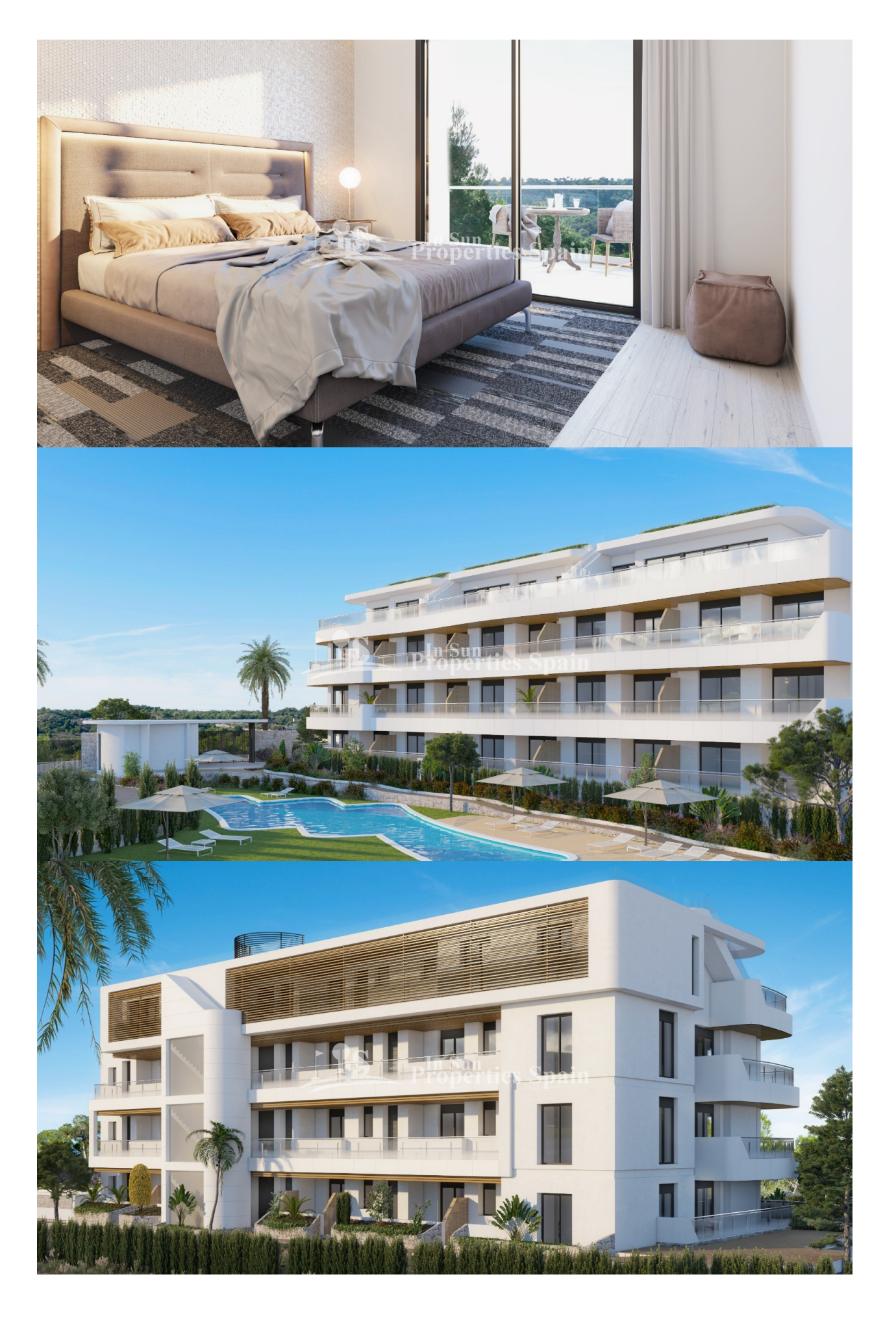
"Experience our experience - Because you deserve the best"