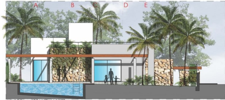
ALZADOS PLANTA JARDÍN DIN A3 E:1/100

EL PRESENTE PLANO ES MERAMENTE INFORMATIVO, PUDIENDO SUFRIR VARIACIONES DURANTE LA OBRA A CRITERIO DE LA DIRECCIÓN TÉCNICA. NI EL MOBILIARIO NI LA JARDINERÍA SON UNA IMAGEN CIERTA DE CÓMO SE ENTREGARÁ LA VIVIENDA.