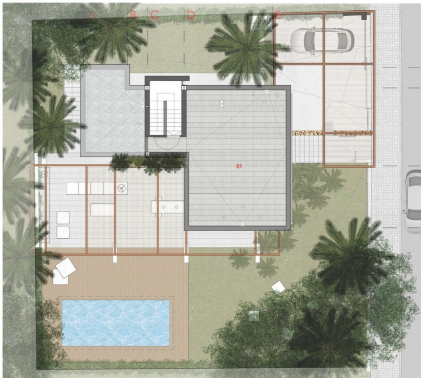
PLANTA ACCESO - TIPO A DIN A3 E:1/100 SUP. CONSTRUIDA PLANTA ACCESO = 101,65 m 2 EL PRESENTE PLANO ES MERAMENTE INFORMATIVO, PUDIENDO SUFRIR VARIACIONES DURANTE LA OBRA A CRITERIO DE LA DIRECCIÓN TÉCNICA. NI EL MOBILIARIO NI LA JARDINERÍA SON UNA IMAGEN CIERTA DE CÓMO SE ENTREGARÁ LA VIVIENDA.

01 - SALÓN-COMEDOR = 31,20 m 2 02 - COCINA = 11,15 m 2 03 - PASO = 5,45 m 2 04 - DORMITORIO 01 = 17,40 m 2 05 - BAÑO 01 = 3,75 m 2 06 - BAÑO 02 = 3,60 m 2 07 - PORCHE DESCUBIERTO = 53,60 m 2 08 - PORCHE CUBIERTO 01 = 4,25 m 2 09 - PORCHE CUBIERTO 02 = 3,20 m 2 10 - APARCAMIENTO = 25,00 m 2 11 - PISCINA = 21,00 m 2