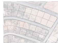
1 2 3 4 - PARCELAS TIPO