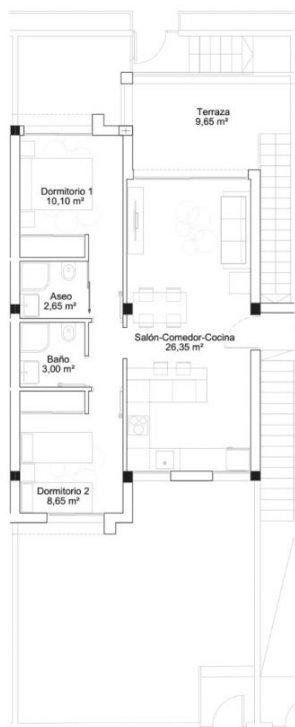
Vivienda 10 - Bloque 2 Planta Alta